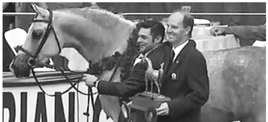
Maghnus Z 2011- Region 15 Reserve Champion HA Hunter Pleasure Jr. Horse, US National Champion HA Halter S/H 4-6 Year-Old and Champion HA Halter S/H AAOTH Reserve Supreme National Champion HA Gelding. Maghnus Z was bred and born in Delaware. (See story on following pages)